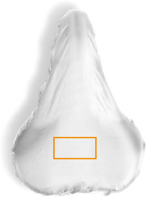
1. TOP SIDE