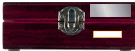
2. FRONT SIDE