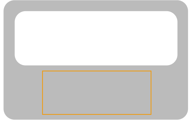
3 + 4. HOLDER