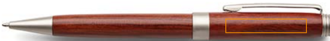
3. NEAR CLIP RIGHT HANDED