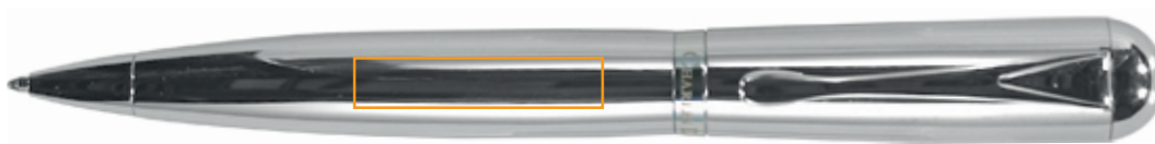
2. IN LINE WITH THE CLIP