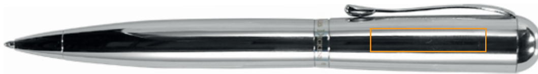
1. NEAR CLIP RIGHT HANDED